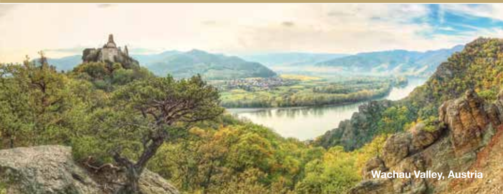
Wachau Valley, Austria

No credit card is required at cruise check-in, and Scenic's River Cruise Guarantee insures against unforeseen disruptions during your cruise.