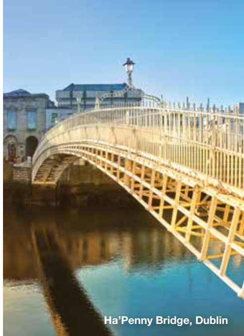
Ha'Penny Bridge, Dublin

Global Destinations Management Ltd. and Go Next Inc. are not responsible for injuries or losses resulting from any causes beyond their own respective and exclusive control or for the negligence of any other suppliers or providers. Land accommodations, local transportation, and sightseeing are arranged and operated by BEM Ireland, which may use other suppliers or providers to render the services. HOTELS AND SIGHTSEEING ARE SUBJECT TO CHANGE.