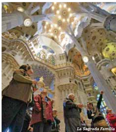
La Sagrada Família