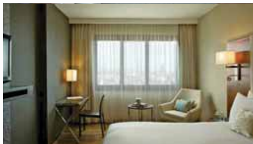
Above: Terrace | Deluxe room