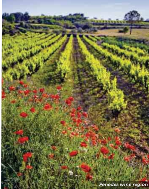
Penedès wine region

NOT INCLUDED -Fees for passports and, if applicable, visas, entry/departure fees; personal gratuities; laundry and dry cleaning; excursions, wines, liquors, mineral waters and meals not mentioned in this brochure under included features; travel insurance; all items of a strictly personal nature.