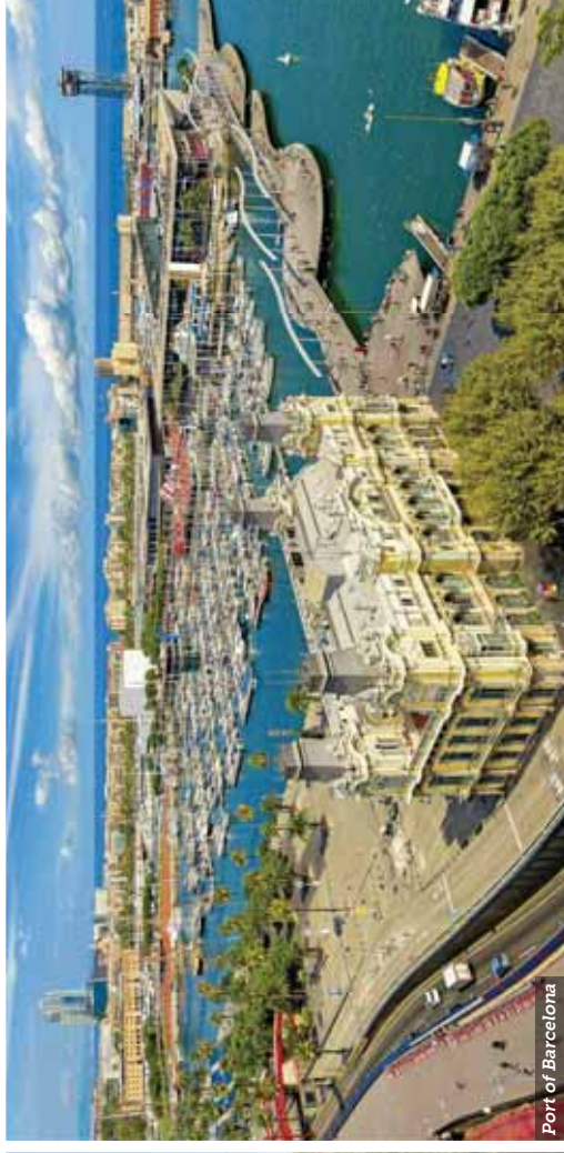
Port of Barcelona