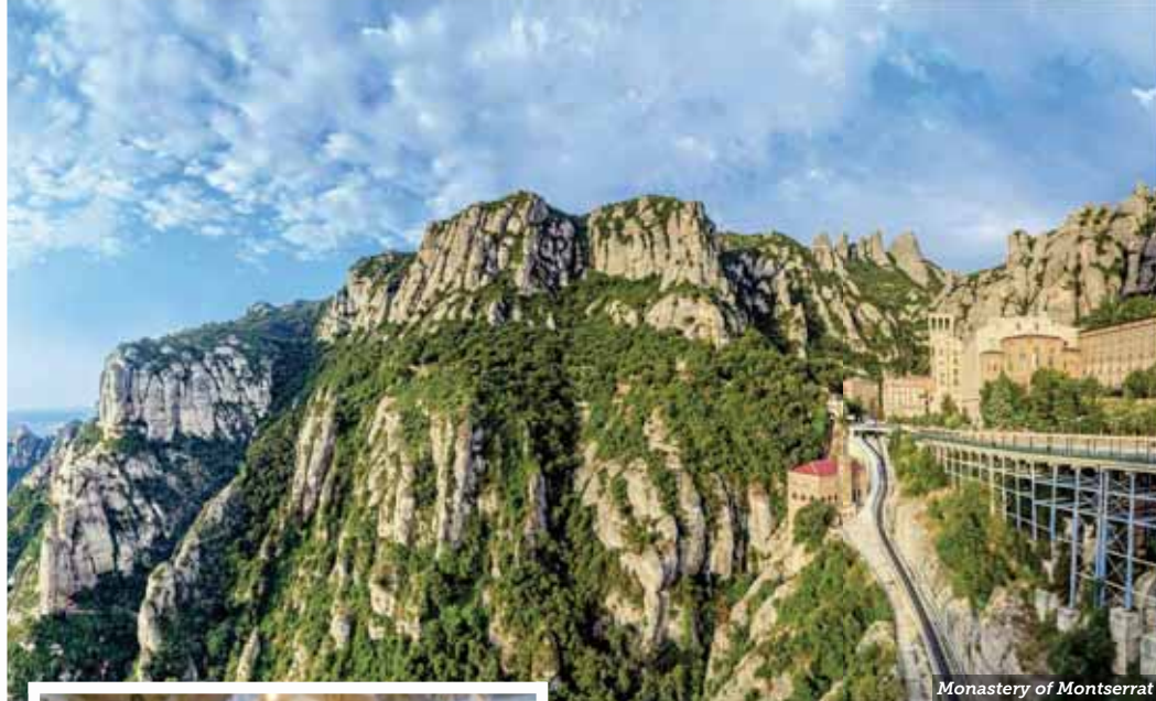
Monastery of Montserrat