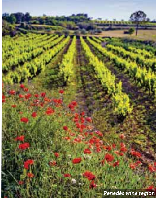
Penedès wine region

NOT INCLUDED -Fees for passports and, if applicable, visas, entry/departure fees; personal gratuities; laundry and dry cleaning; excursions, wines, liquors, mineral waters and meals not mentioned in this brochure under included features; travel insurance; all items of a strictly personal nature.