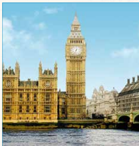
REGAL LONDON POST-PROGRAM OPTION

The Travel Program outlined here is subject to the features, final pricing and terms and conditions set forth in the published Travel Program brochure. Upon receipt of the published Travel Program brochure, you will be given 10 days to reconfirm your reservation, at which time any deposit(s) will become subject to cancellation fees.