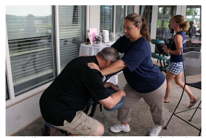
Golfers receive back and neck massages after lunch

Due to the annual Golf Tournament's continued success, the Virginia Tech Alumni Association was pleased to present the Prince William Chapter with the Best Golf Tournament Award at the 2012 Chapter Officers Forum in Blacksburg.