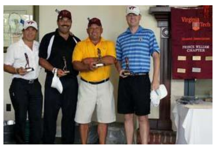
First place winners will travel to Pinehurst to compete again

Golfers enjoyed a continental breakfast after registration and had the opportunity to visit with vendors before teeing off. There were several contests to compete in, including a team putting contest, longest drive, closest to the pin, straightest drive, and longest putt. There were also multiple prizes to be won at each of the par 3s if someone got a hole-in-one, including the chance to win a 2012 Acura. The winning team received invitations to represent Virginia Tech in the 2012 College Alumni Team Championship at Pinehurst, an all-expenses paid trip.