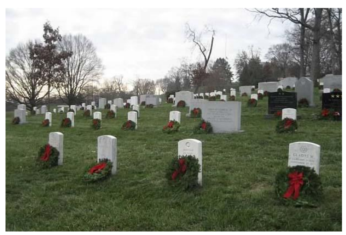
Freshly-placed wreaths at Arlington National Cemetery