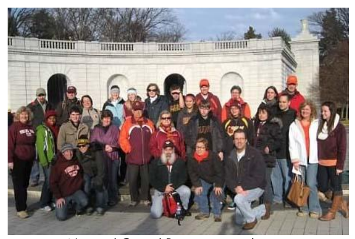
National Capital Region area volunteers