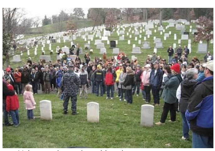
Volunteers brave the cold as they receive instructions