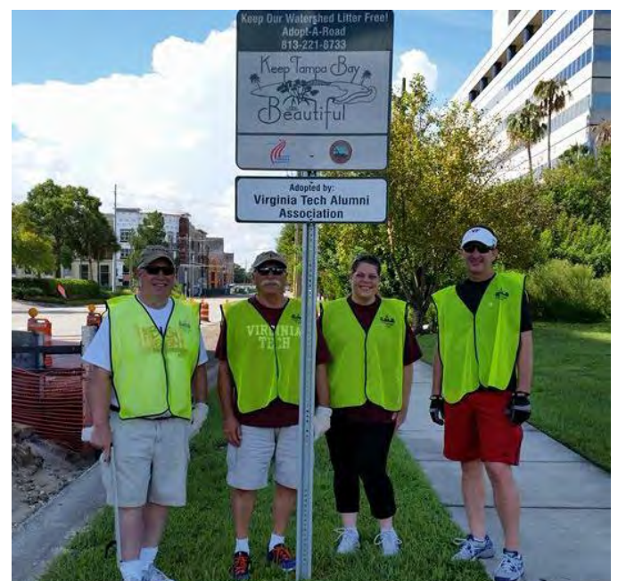
The Tampa Bay Chapter poses near their very own “Keep Tampa Bay Beautiful” sign