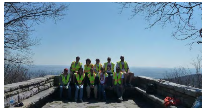
Western Maryland Hokies take a break from their Adopt-a-Road project to enjoy the scenic view