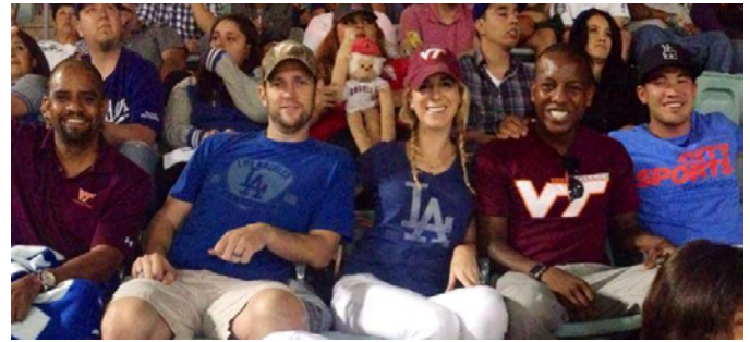
Los Angeles area Hokies enjoyed an evening at Dodger Stadium where they were featured on the Jumbotron!