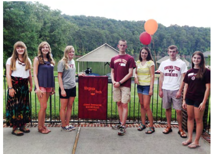
Scholarship recipients and other students from the Knoxville Chapter area joined alumni for their annual picnic