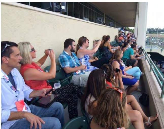
The South Florida Chapter hosted a social at Gulfstream Park while enjoying a day at the races