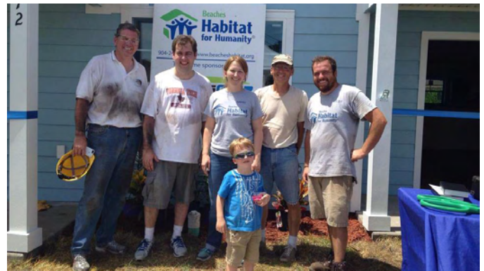
Volunteers from the Jacksonville Chapter participated in a local Habitat for Humanity build project