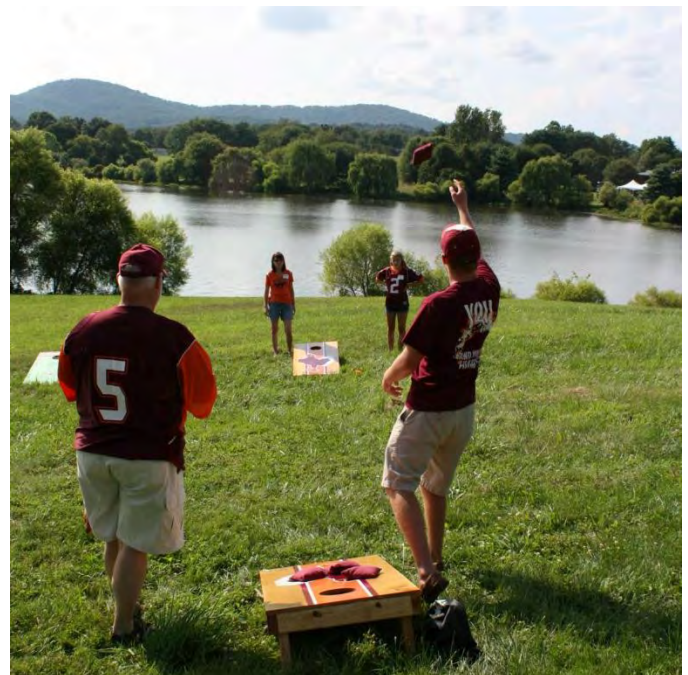
Fauquier Chapter Hokies prepare for a busy tailgating season with cornhole, Hokie-style!