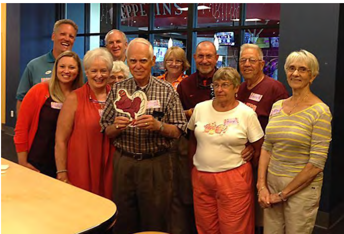
Flat Hokie visited alumni at a Hilton Head Chapter gathering earlier this summer