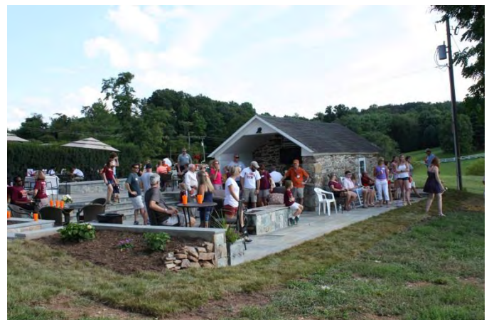
Fauquier area alumni enjoy a summer afternoon at Copper Top Farm in Marshall, Virginia