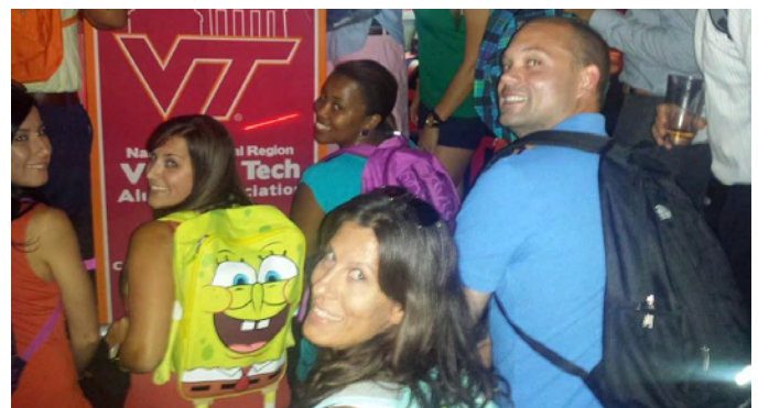
National Capital Region alumni participated in the chapter's 2 nd Annual Backpack Drive for local children