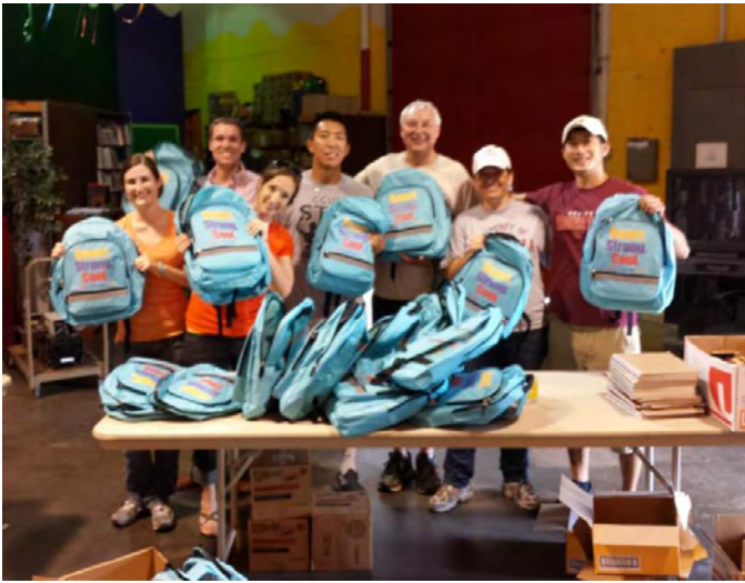
The St. Louis Chapter participates in a local school supply drive at the Kidsmart Warehouse in Bridgeton, MO