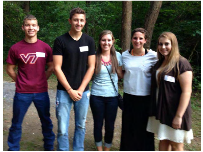
Students from the Southwest Virginia Chapter joined alumni in Brisol, VA for a cook-out dinner