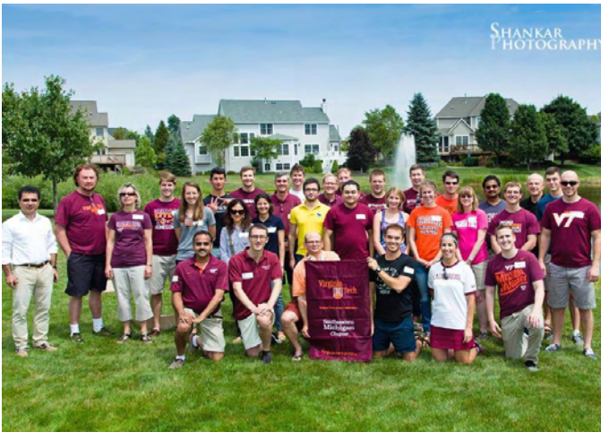
The Southeastern Michigan Chapter hosted their picnic at a private alumni home in Ann Arbor, Michigan