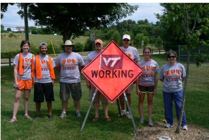
The Knoxville Chapter models their Hokie Nation Serves t-shirts while working their quarterly clean-up