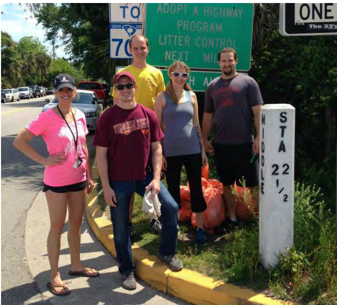
Charleston Hokies clean-up a section of highway this spring

If you’re interested in starting an Adopt-a-Road program with your chapter volunteers, talk to your chapter liaison for more information. And don’t forget your Hokie Nation Serves t-shirts!