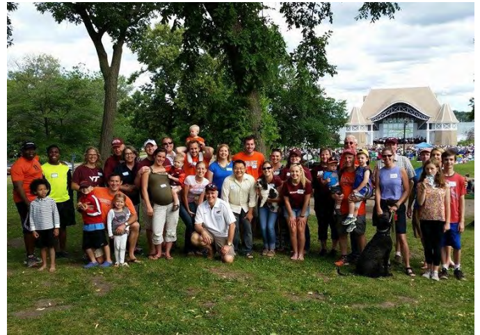
The Minnesota Chapter hosted their picnic in combination with a Minnesota Pops performance