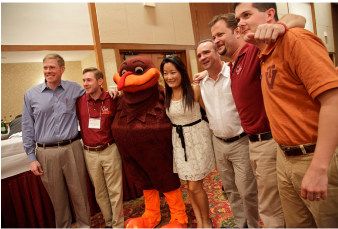
National Capital Region Chapter officers hangin' out with HokieBird at the 2011 Chapter Officers Forum

Watch your e-mail for registration information coming soon.