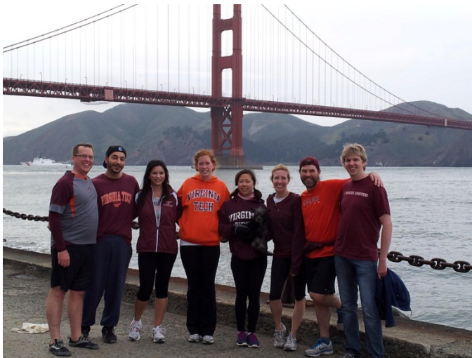
In the San Francisco Bay Area chapter, Hokies met in the Marina District to run 3.2 miles with their fellow alumni.