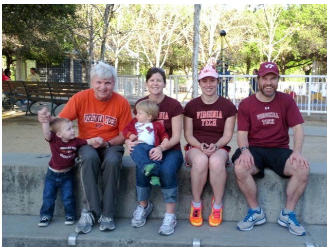
Others met up in San Jose to walk in remembrance.