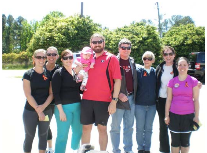
The Research Triangle Chapter was joined by JMU, UGA, Miami, UNC and NCSU alumni, along with others.