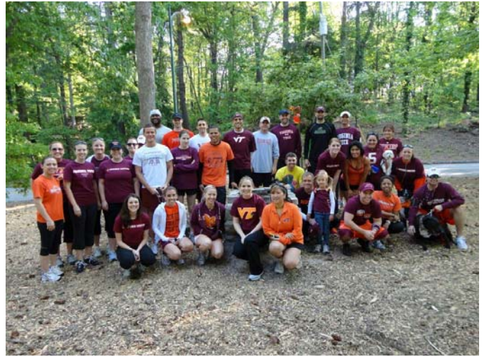
In Atlanta, alumni joined together at Chastain Park in Buckhead, Georgia to honor those lost on April 16, 2007. The chapter provided light refreshments for the walkers and had a terrific turnout.

Chapters hosting these events included the San Francisco Bay Area (with an additional event held in San Jose), Knoxville, Atlanta, Denver, and Research Triangle. Participants were able to spend the day with local Hokies, feeling the support of community and remembering lives lost in 2007.