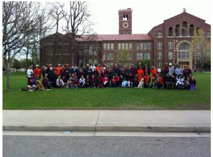
The Denver Chapter included a pre-run balloon launch and a fundraiser for the Koshka Foundation.