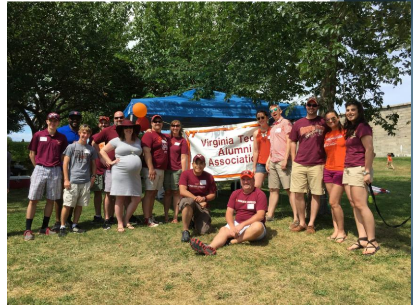
New England Chapter, 2015