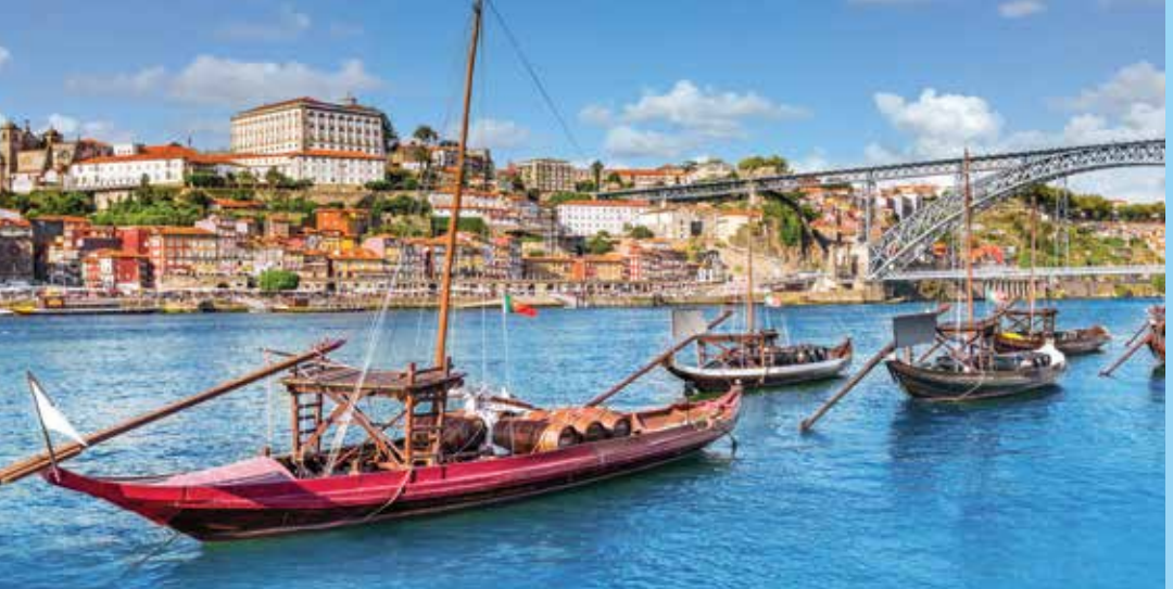
Flat-bottomed rabelo boats once transported casks of port wine along the Douro River to the lodges of Oporto.

D-Day bombardments. Survey the serene English Channel and reflect on the commemorative crosses and Stars of David in the American Military Cemetery at Colleville-sur-Mer.