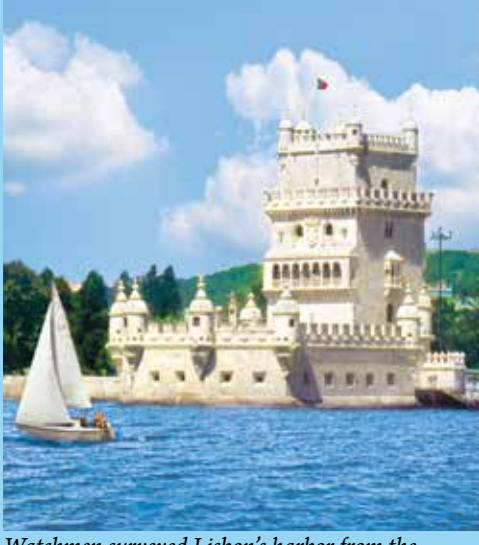
Watchmen surveyed Lisbon's harbor from the 16<sup>th</sup>-century Tower of Belém.

Attend the Captain's Welcome Reception and Dinner this evening.