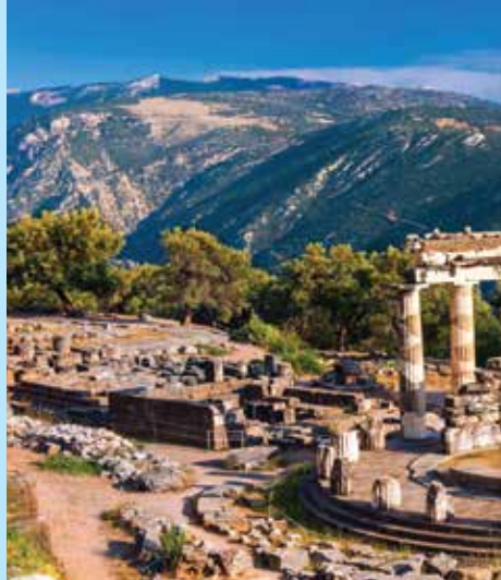
Admire the graceful Doric columns of the Tholos