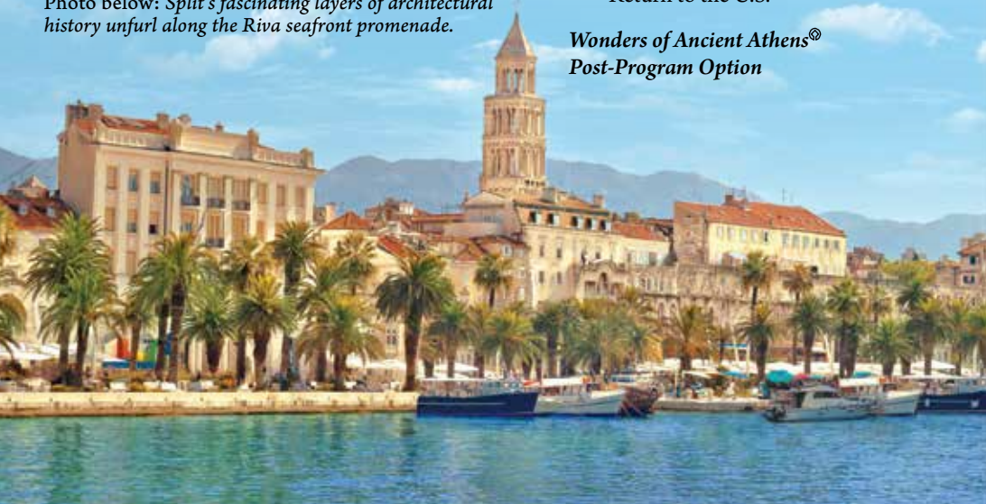
Photo below: Split's fascinating layers of architectural history unfurl along the Riva seafront promenade.

Photo above: Appreciate the Romanesque architecture of St. Tryphon Cathedral.