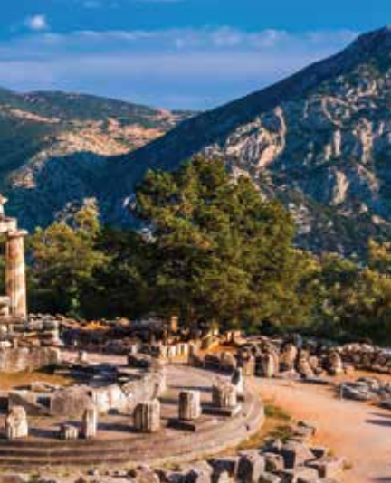
of Delphi in the Sanctuary of Athena Pronaia.