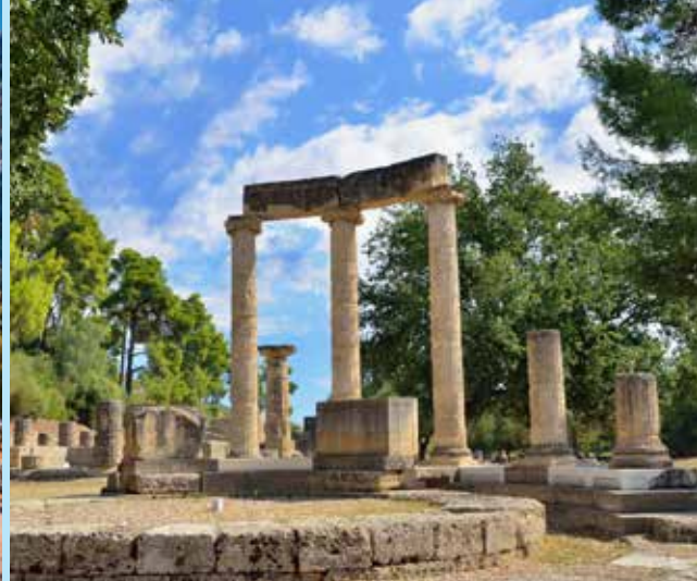
Explore the ancient ruins of the Philippeion temple in Olympia, where the first Olympic Games were held over 2,500 years ago.