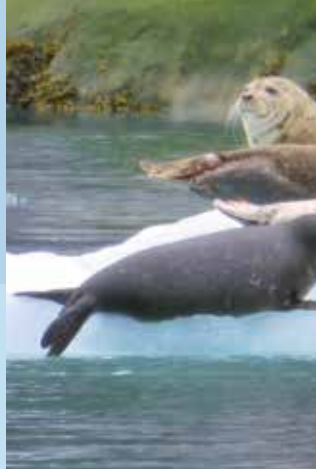
Cruise into narrow Endicott Arm