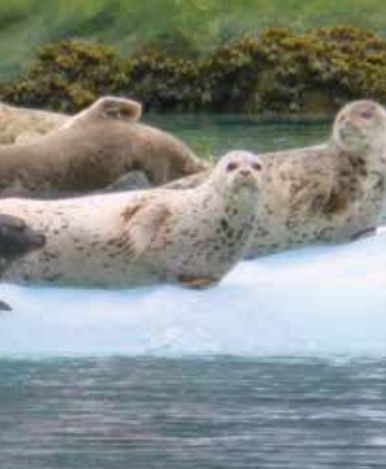
Fjord for harbor seal watching.