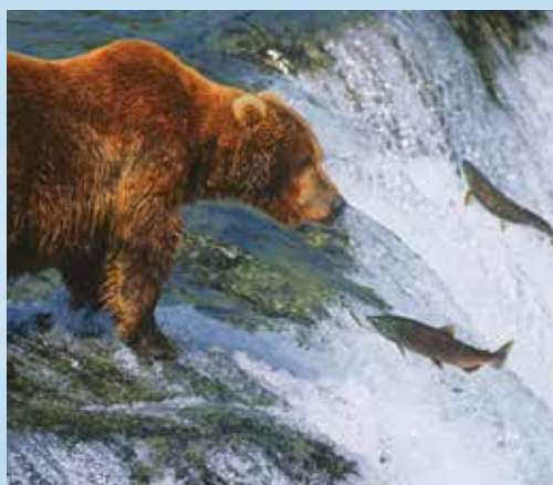
Observe indigenous brown bear catching wild salmon.