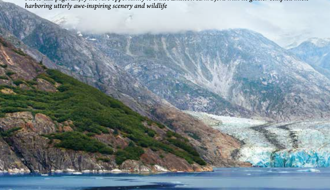
Photo this page: Enjoy the rare opportunity to cruise Endicott Arm Fjord with its glacier-sculpted inlets harboring utterly awe-inspiring scenery and wildlife

Cover photo: Encounter the cobalt-blue ice of calving glaciers while cruising through Tracy Arm Fjord.