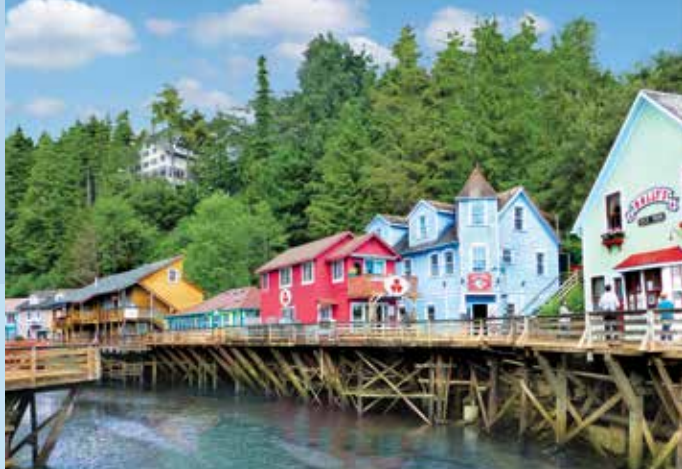
Stroll Ketchikan's historic downtown, where over 30 wood-frame houses are trussed on wooden pilings.

its indigenous and Russian history. The town flourished as a Russian fur trading hub until its 1867 transfer to the United States.