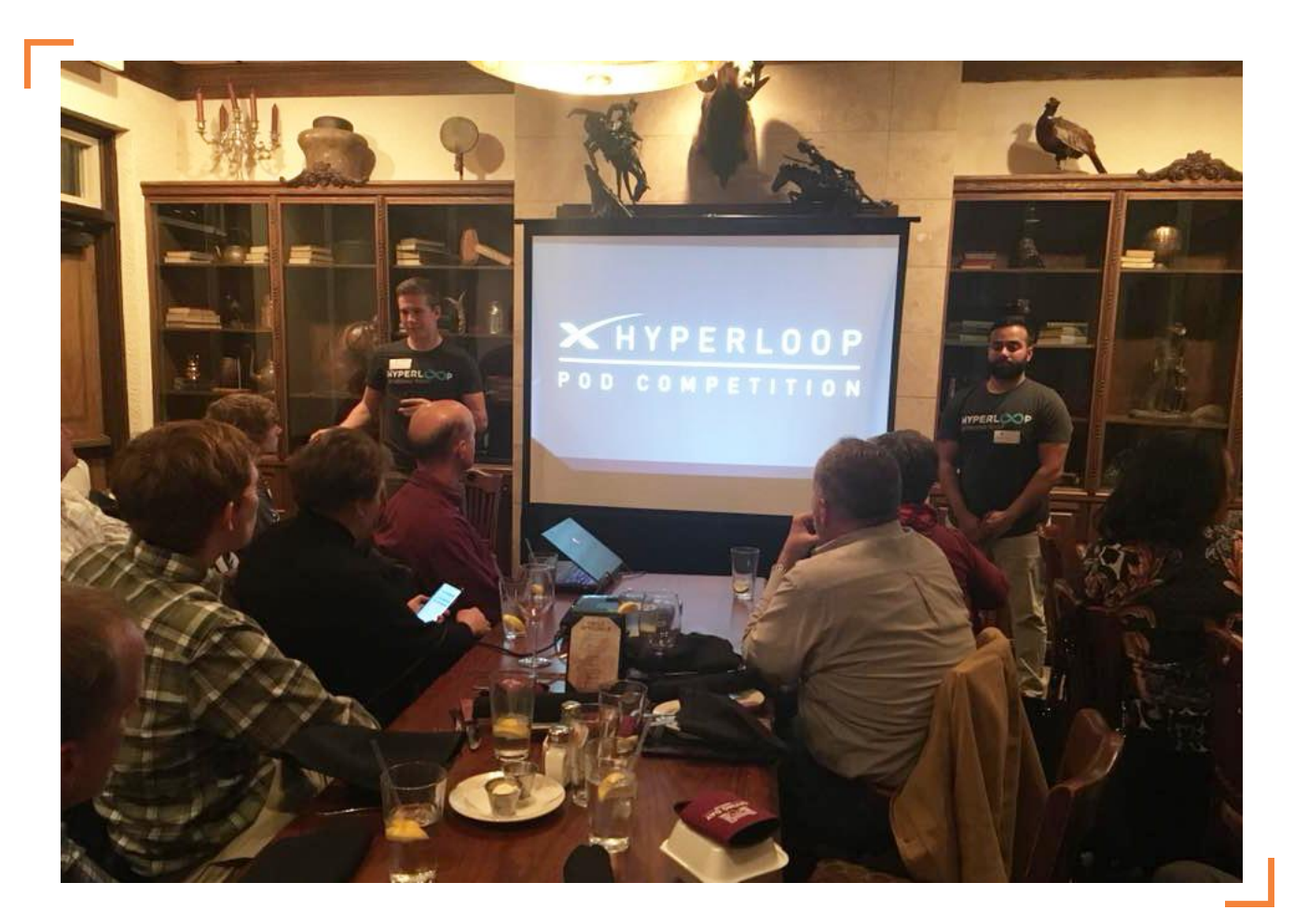
Hyperloop Team, March 2018