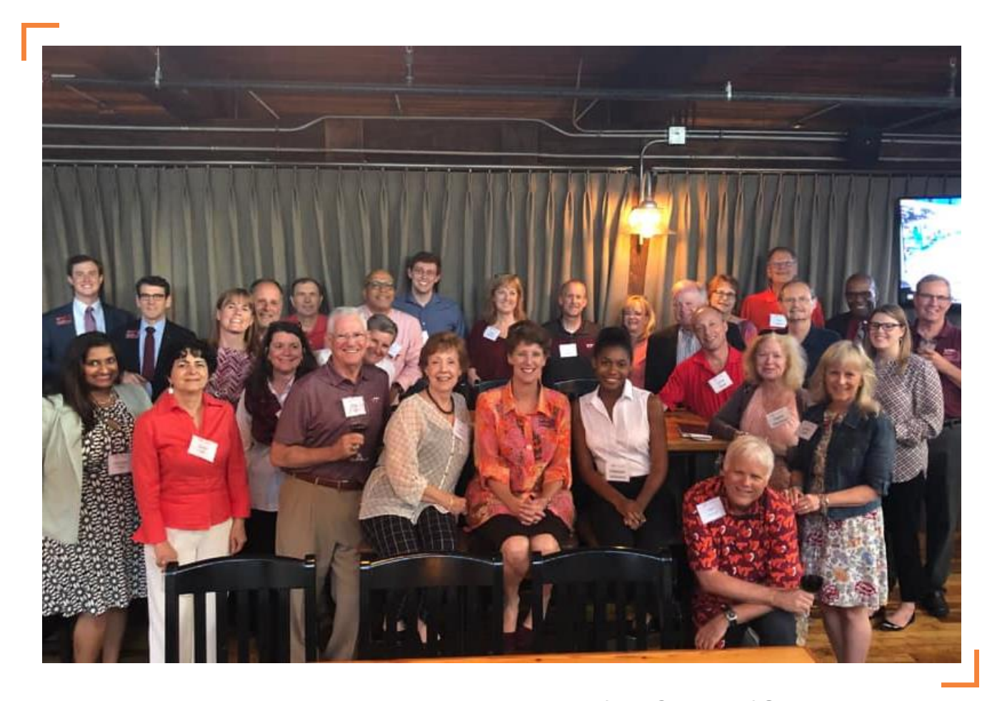
Dean of the College of Science, May 2019