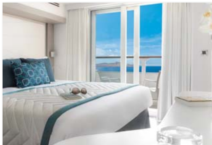
Stateroom with Balcony

The state-of-the-art propulsion system and custom-built stabilizers provide an exceptionally smooth, quiet and comfortable voyage. By design, the ship is energy efficient and environmentally protective of marine ecosystems and has been awarded the prestigious "Clean Ship" designation due to its advanced eco-friendly features, a rarity among ocean-cruising vessels. The ship has two tenders.