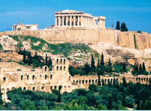
The iconic, 447 B.C. Parthenon is dedicated to the goddess Athena, the patron of the citizens of Athens.

Delos' awe-inspiring ruins also showcase an entire district of Hellenistic and Roman-era houses and a 5500-seat theater (300 B.C.), the site of choral competitions during the quadrennial Delian festival.