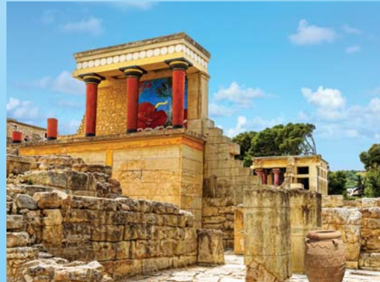
The legendary site of Knossos was first excavated in 1899 by British archaeologist Sir Arthur Evans.

CULTURAL ENRICHMENT: Tour the phenomenal Bronze Age ruins of Akrotiri, recently reopened to visitors. Held intact by layers of pumice and ash for over 3500 years, Akrotiri's streets reveal the architectural sophistication and advanced culture of its Minoan inhabitants.