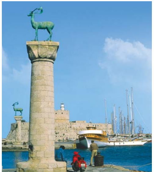
The bronze stag symbolizes the Colossus of Rhodes, one of the Seven Wonders of the Ancient World.