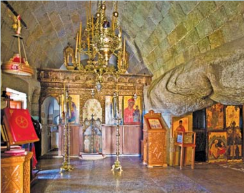
St. John the Apostle is believed to have written the Book of Revelation in the Cave of the Apocalypse on Pátmos.

See the magnificent Terrace of the Lions, where legendary marble statues guarded the island for nearly 2600 years.