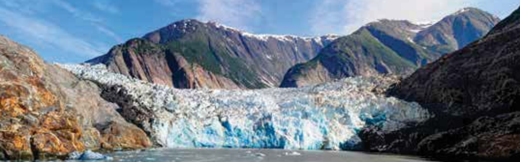
Sawyer Glacier, Tracy Arm

Oceania Cruises may modify the cruise itinerary up to and during the voyage. Air arrangements, cruise accommodations, local transportation, and optional shore excursions are arranged by Oceania Cruises, which may use other suppliers or providers to render the services. The agreement in this brochure is the exclusive and entire statement of the agreement between you and Go Next, Inc. It should be read carefully.