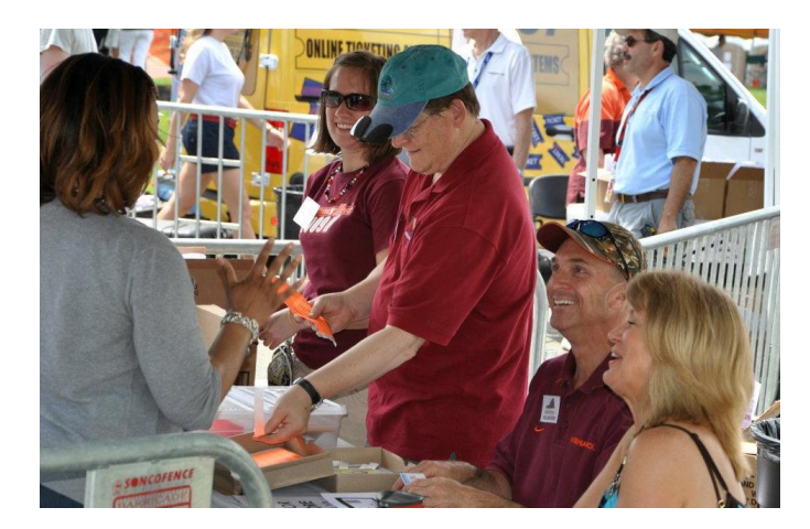
Richmond Chapter volunteers work the admission booth