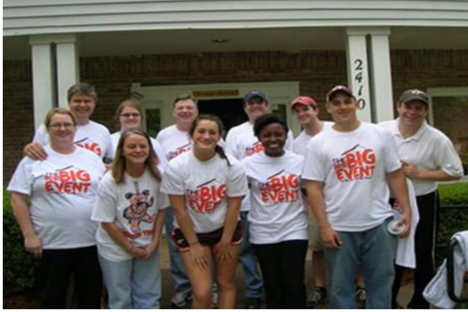
Charlotte Chapter volunteers at Charlotte Family Housing