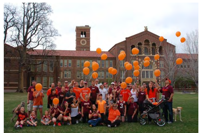
75 Denver Hokies came out for their annual 3.2 for 32 Run/Walk in Remembrance