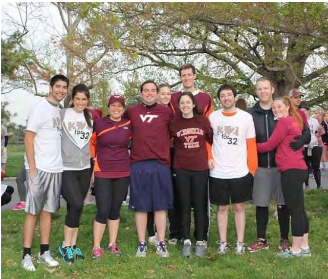
The National Capital Region Chapter hosted its own 3.2 for 32, complete with custom t-shirts!