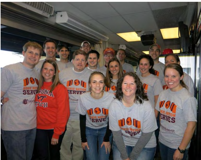
The Palmetto Chapter volunteered at local Flour Field concession stand to support their scholarship fund