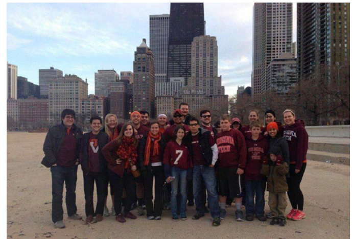
Chicago Chapter area alumni volunteered to help with a Senior Breakfast at Chicago Cares

If your chapter would like to begin planning a remembrance event for 2015, please contact your chapter liaison for more information.