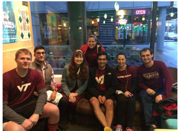
The Seattle Chapter hosted a Hokie Run & Social Time to encourage a sense of community among local alumni