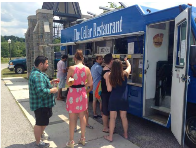
Several food vendors were on hand to serve festival patrons, including The Cellar, a longtime Blacksburg favorite