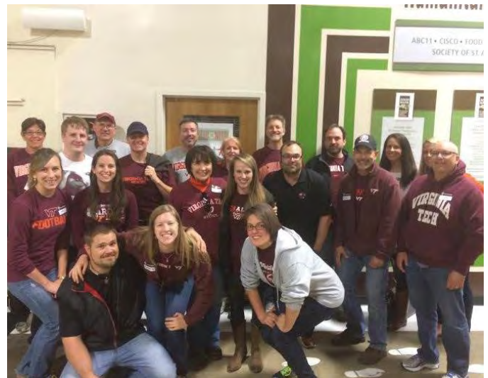
Triangle Chapter volunteers also participated in a food bank service event on April 16