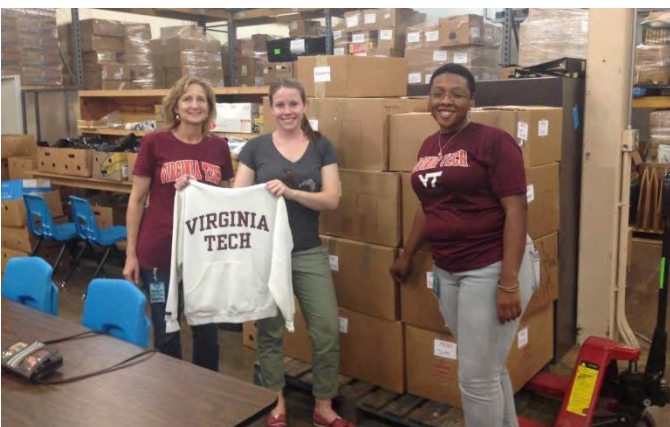
Central Pennsylvania Chapter alumni volunteer at Mission Central in Mechanicsburg, PA