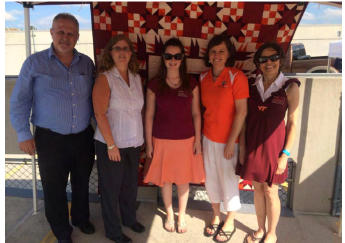
New River Valley Chapter officers staff a booth at Blacksburg's monthly Up on the Roof social event