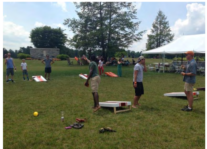
Festival goers enjoy cornhole and other games on the Holtzman Alumni Center lawn