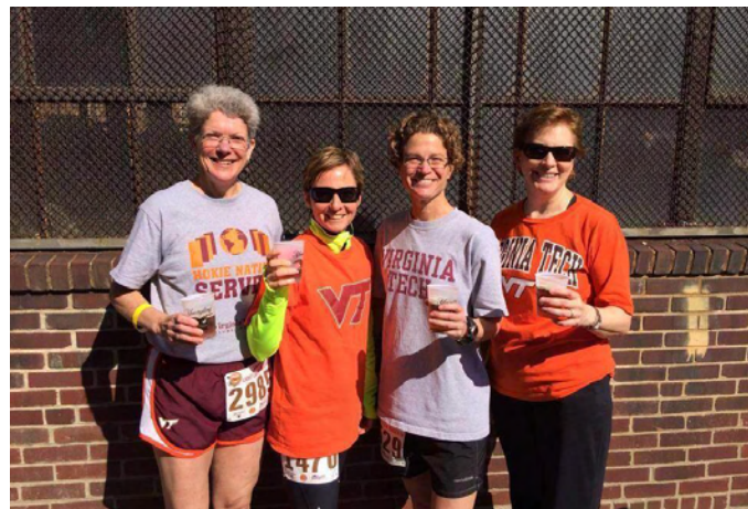
The Central Pennsylvania Chapter hosted a "virtual" Run, asking alumni to participate from wherever they are!

Several chapters host 3.2 for 32 Walk/Run events in conjunction with the race on campus, but many choose unique events that are meaningful to their local community. The Coastal Carolina Chapter participated in a Day of Remembrance at Coastal Carolina University that included an annual candlelight vigil. Seattle alumni volunteered at a local farm that supplies community food banks. The Greenville Chapter volunteered at a minor league baseball field concession stand and the Tidewater Chapter held a memorial service to honor the members of the Hokie family who lost their lives on April 16.