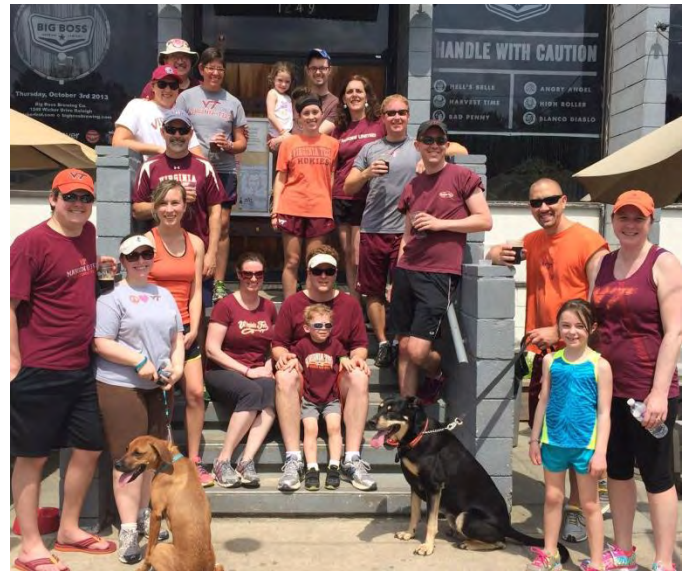
The Triangle Chapter hosted its annual 3.2 for 32 Run, followed by a social gather for the whole family