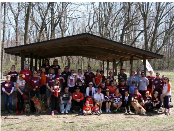
Philadelphia area alumni turned out for a run/walk at a local state park in Newtown Square, PA