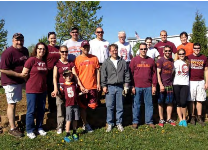
The Kentuckiana and Lexington Chapters joined forces for a combined service project in Louisville, KY