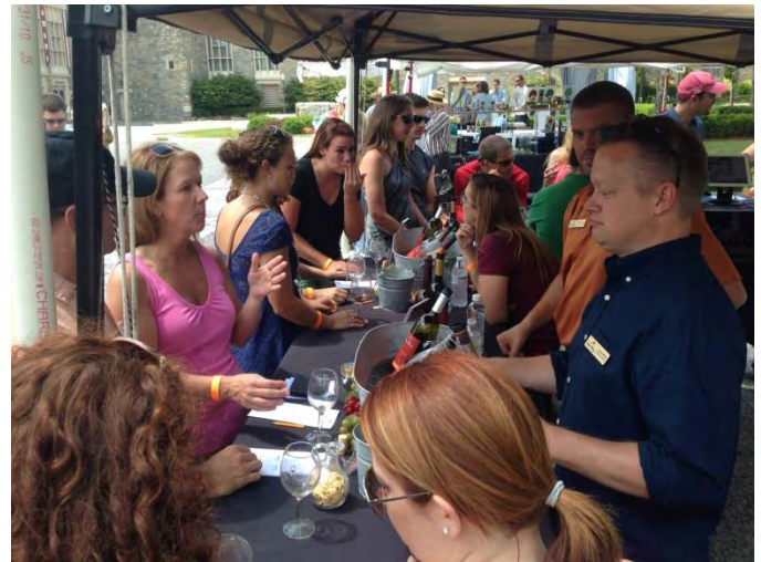
Patrons line up at Stanburn Winery to sample their locally grown varieties