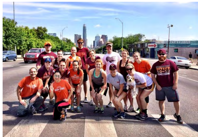
Alumni gather in Austin, Texas for their inaugural 3.2 for 32 Walk in Remembrance

From VirginiaTechforLife blood drives and Habitat for Humanity builds, to food pantry and Adopt-a-Highway cleanup projects, our alumni are engaged in helping to meet the needs of their local communities, carrying on our Virginia Tech tradition of service.