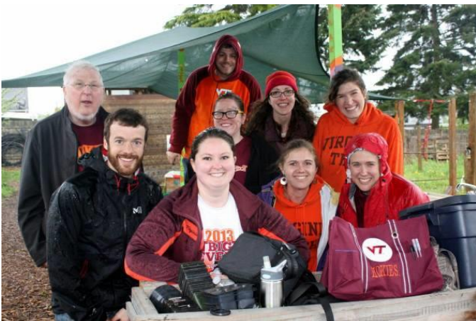
Seattle area alumni participate in the Seattle Chapter's 2013 Big Event project at Marra Farm