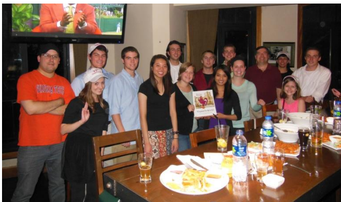
Virginia Tech alumni and Pamplin College of Business students gather in Shanghai, China

The alumni enjoyed meeting the traveling students and faculty and are working towards organizing more Shanghai, Guilin, and Beijing events.