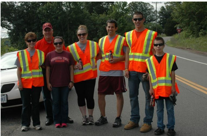
Prince William Chapter volunteers gather for their Adopt-a-Highway community service project