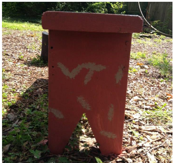
Atlanta Chapter volunteers left their mark at the Sugar Creek Gardens!