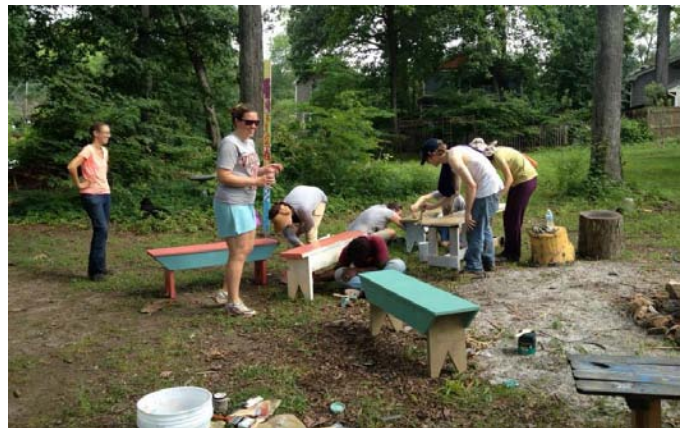
One of the group projects was to spruce up some benches around the garden that needed a fresh coat of paint