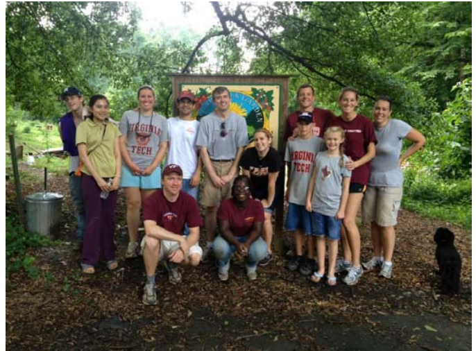
Atlanta Chapter volunteers gather for the Sugar Creek Garden Clean-Up Project in June