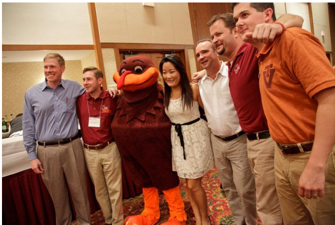
National Capital Region Chapter officers hangin' out with HokieBird at the 2011 Chapter Officers Forum

We look forward to seeing you back on campus!