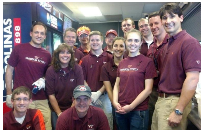
Palmetto Chapter alumni staff a concession stand at the April 16 Greenville Drive baseball game